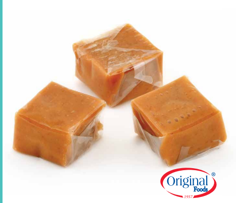
7921 CREAMY CARAMELS 13.61 kg