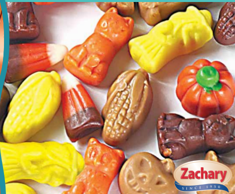
616 HAL. MIXED HARVEST CREAMS (FALL FESTIVAL) - CANDY GUY 13.61 kg