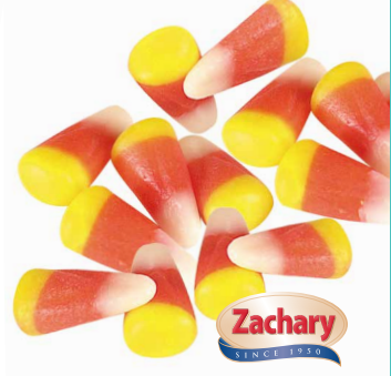
252 CANDY CORN REGULAR 13.61 kg