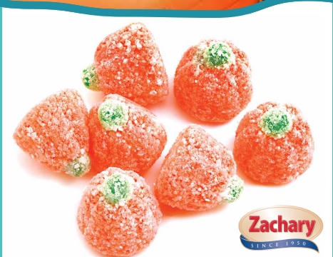
6486 SOUR JELLY PUMPKINS (2040 CT) 13.61 kg