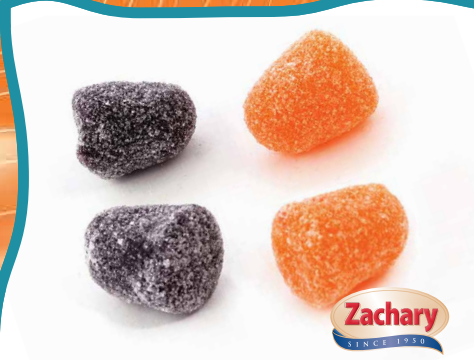
10283 HALLOWEEN SPICED DROPS 13.61 kg

ALL ORDERS MUST BE RECEIVED BY MAY 10 TH , 2024