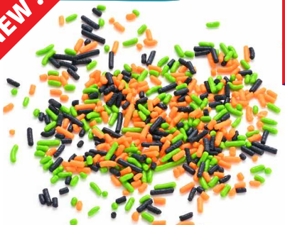
30795 HALLOWEEN SPRINKLES (ORANGE/GREEN/BLACK) 11.34 kg