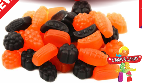
555303 HALLOWEEN JUBES ORANGE/BLACK 10.00 kg