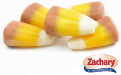
267 CANDY CORN - CARMEL 13.61 kg