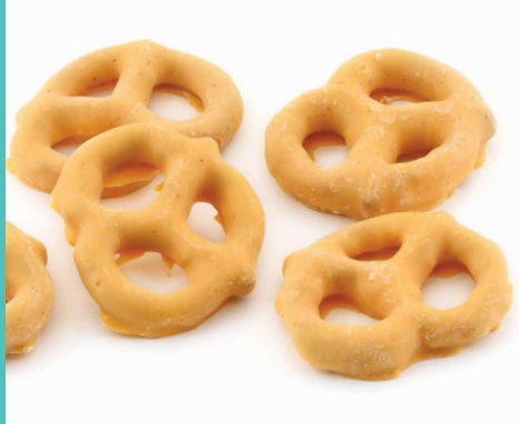
6466 NATURAL PUMPKIN-SPICED PRETZELS 6.80 kg