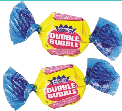
1070 DUBBLE BUBBLE TWIST (1800 CT) 11.34 kg