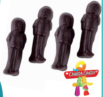
553391 CCC LICORICE BUDDIES 10.00 kg