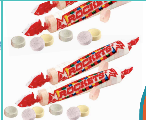
804 WRAPPED CE DE ROCKETS (1344 CT) 10.00 kg