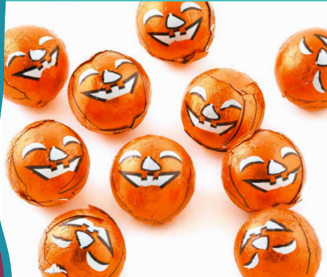
619 HALLOWEEN MILK CHOCOLATE PUMPKINS (1538 CT) 10.00 kg