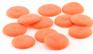
4001 ORANGE VANILLA WAFERS 11.34 kg