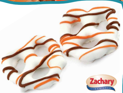
6726 YOGURT ORANGE/BLK DRIZZLE PRETZELS 6.80 kg