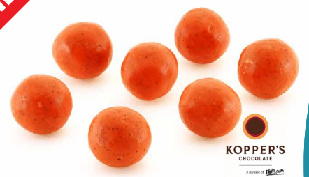
6831 PUMPKIN SPICE MALTED MILK BALLS 11.34 kg