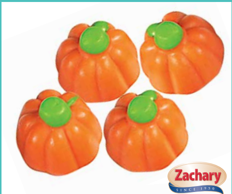
613 HALLOWEEN CREME PUMPKINS CANDY GUY 13.61 kg