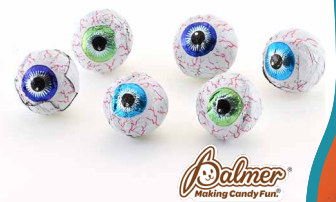
2982 GOOGLY EYES 13.61 kg