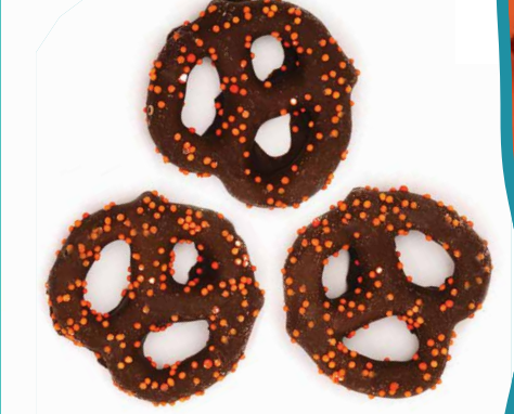
6467 CHOCOLATY PRETZELS WITH ORANGE NON PAREILS 6.80 kg