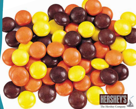
546 REESE'S PIECES 10.00 kg