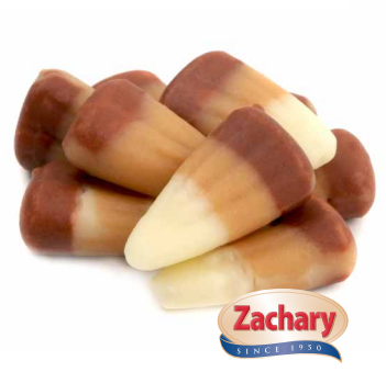
265 CANDY CORN - SMORES 13.61 kg