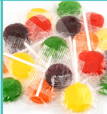
93399 WRAPPED ASSORTED FRUIT LOLLIPOP (13.61 KG) 13.61 kg