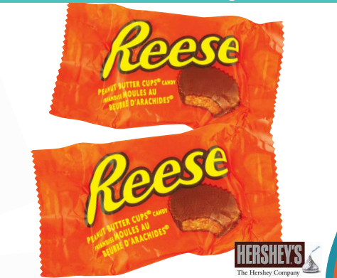
2844 REESE PEANUT BUTTER CUPS JR. (15.6g) 7.35 kg