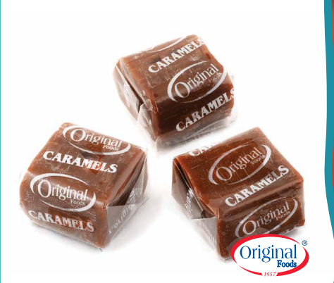
7901 FUDGE CARAMELS 13.61 kg

JOHNVINCE FOODS, 555 STEEPROCK DR., TORONTO, ON M3J 2Z6 WWW.JOHNVINCE.COM TEL: (416) 636-6146 TOLL FREE: 1-800-268-7950 FAX: (416) 636-6177 TOLL FREE FAX: 1-800-680-8288