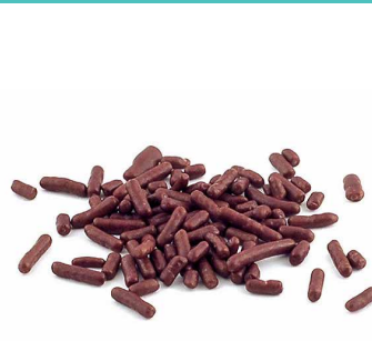
30792 SPRINKLES CHOCOLATE 11.34 kg