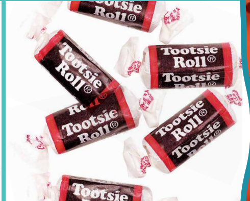
816 CHOC. MINI TOOTSIE MIDGEES (2055 CT) 13.61 kg