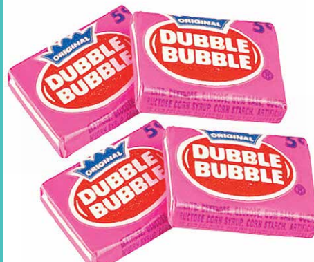
199 DUBBLE BUBBLE GUM (1663 CT) 10.00 kg