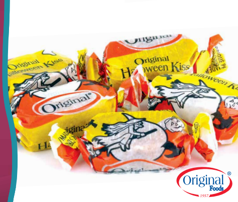
6633 HALLOWEEN TOFFEE KISSES 10.00 kg