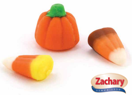
10282 AUTUMN MIX 13.61 kg

JOHNVINCE FOODS, 555 STEEPROCK DR., TORONTO, ON M3J 2Z6 WWW.JOHNVINCE.COM TEL: (416) 636-6146 TOLL FREE: 1-800-268-7950 FAX: (416) 636-6177 TOLL FREE FAX: 1-800-680-8288