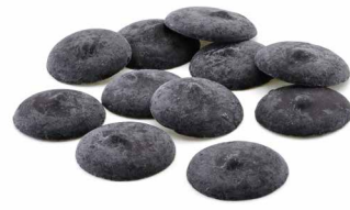
4002 BLACK VANILLA WAFERS 11.34 kg