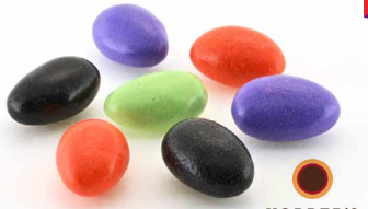
6832 HALLOWEEN CHOCOLATE ALMONDS 11.34 kg