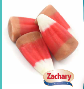
266 CANDY CORN - CARMEL APPLE 13.61 kg