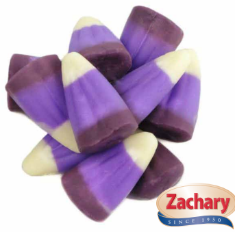
270 CANDY CORN - BLACKBERRY COBBLER 13.61 kg